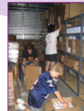
Team of volunteers in the warehouse