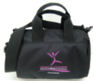
Chemo Care Kit Tote

so many volunteer projects in my life, but this is by far the most gratifying. I feel like I'm helping each cancer patient know they're not alone and that someone else has been on this journey. It's probably the most important volunteer work I've ever done."