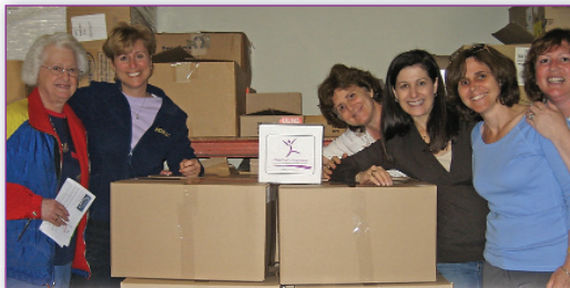
Thanks to the Sinai Temple "moms" for quality control inspections, along with arranging carpools and snacks!