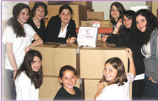
Families from Sinai Temple in West Los Angeles also spent some of their spring vacation helping at the Hurdle Jumpers' Logistics Center